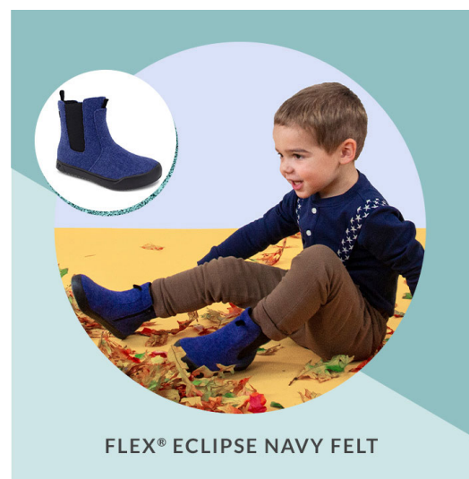
FLEX® ECLIPSE NAVY FELT

To Shop all pediped® Flex® shoes in sizes EU20-36 (US5-4.5Youth), visit pediped.com/bigkid