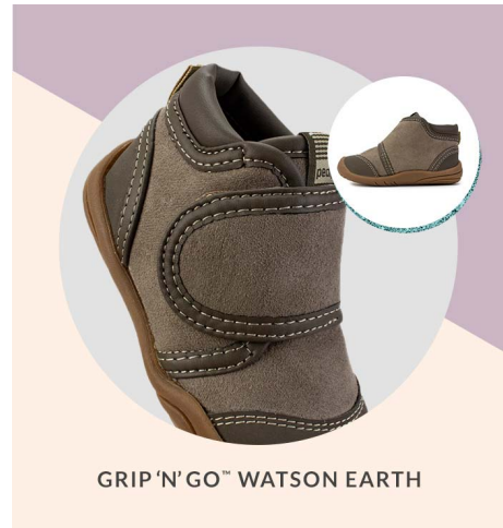
GRIP 'N' GO™ WATSON EARTH

To Shop all pediped® Grip 'n' Go™ shoes in sizes EU19-23 (US4-7), visit pediped.com/toddler