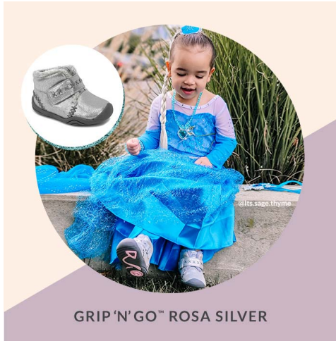
GRIP 'N' GO™ ROSA SILVER

Our Grip 'n' Go™ line includes all the benefits of our Originals® but also have special G2 Technology™ , which includes a soft rubber sole, rounded edges that mimic the shape of a child's foot, heel stability, and a soft toe box to allow toes to grip the floor. Grip 'n' Go™ provide active toddlers with the ideal combination of comfort, protection and flexibility. Move into these styles once your child is walking 20 – 30 steps on their own without the help of holding onto mom and dad or objects around the house.