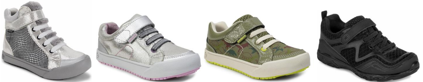
(Flex ® styles from left to right): Logan Silver ($59.95) Dani Silver ($56.95), Dani Earth Dino ($56.95) Force Black ($60)

Visit https://www.pediped.com/bigkid for 80+ Fall/Winter styles and colors for your confident walkers!