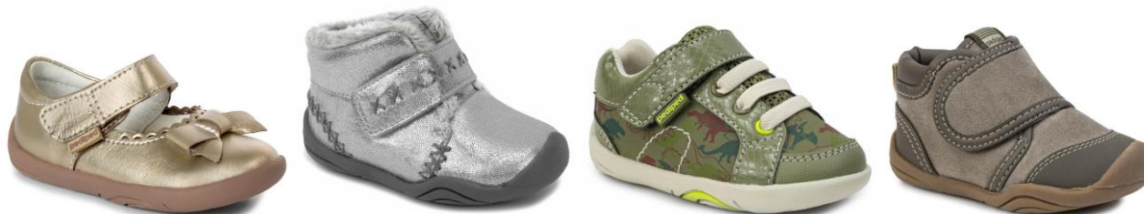
(Grip 'N' Go™ styles from left to right): Betty Champagne ($52), Rosa Silver ($54), Dani Earth Dino ($48.95), Watson Earth ($52.95)

Visit https://www.pediped.com/toddler for 70+ Fall/Winter styles and colors for toddlers!