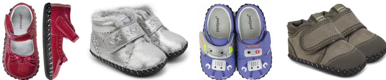
(Originals® styles from left to right): Isabella Red ($41.95, now $29), Rosa Silver ($41.95), Art Robot ($39.95), Watson Earth ($39.95)